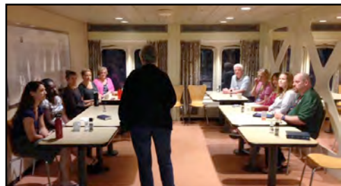
STS Bible stories on Mercy Ships

The team gave or sold for a little money, Bibles and SD memory cards with different languages containing God’s Story , the Bible, STS material and more. They also gave people medicines and clothes, visited orphanages where they did