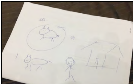
Communicating sheep at market.

The two ladies exuberantly talked to one of the Cambodian ladies in the night market. Imagine mixing Mandarin and Khmer! These girls told the story of Jesus leaving the 99 sheep to go after the one. By the time the story finished, the night market lady had accepted Jesus.