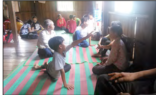
Boy asks for friend to join group.

Our instructor shared, “Today, in the hottest part of the afternoon, when everyone took showers at lunch to beat the heat, our sugar cane seller showed up and didn’t make a dime. No one was willing to leave the ‘training’ to go get juice. Guess